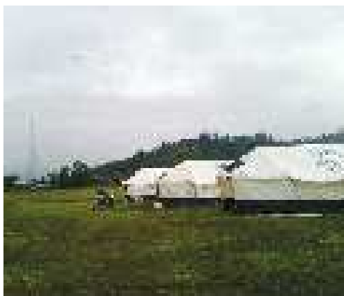
New IDPs camp in Shatuzup village

The Burma Army offensives during 2016 have led to fresh displacement and setting up of new Kachin IDP settlements. The operations south of Tanai in July 2016 led to the displacement of over 1,000 people. Over 500 were migrants working in the gold mines, who the Burmese government arranged to send back to their places of origin in August. About 400 IDPs from four local villages -- Lawt Ja, Awng Len, Hka Da Zup and Hkaw Seng -- are still unable to return to their homes, as Burmese troops remain guarding their villages and have laid landmines in the area. These IDPs are staying in Shatuzup village in