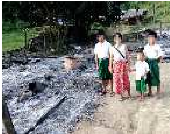
Houses burned in Nam Mya village by Burma Army militia

Burma Army troops have also deliberately set fire to civilian houses. On January 13, 2016, Burma Army troops of Division 99 and IB 290 burned down 12 houses in Hu Bung village, Tamonye, northern Shan State, after fighting had taken place in the village. On May 22-23, 2016, Burma Army troops and militia set fire to two houses in the village of Man Ping, close the Chinese border near Mong Ko, northern Shan State. On August 15, 2016, troops of the local Burma Army militia set fire to two houses in Nam Ya village, Phakant township, Kachin State.