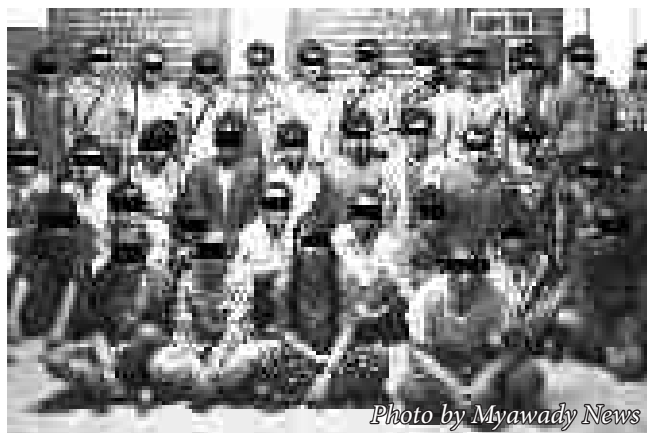
Detained Putao villagers

On October 11, 2016, 49 villagers from Putao in northern Kachin State were arrested at a Burma Army checkpoint when returning from an agricultural training organized by church leaders in a KIA area. The group, including six women and several elderly men, have been charged with unlawful association and are being detained in Moe Mauk Prison.