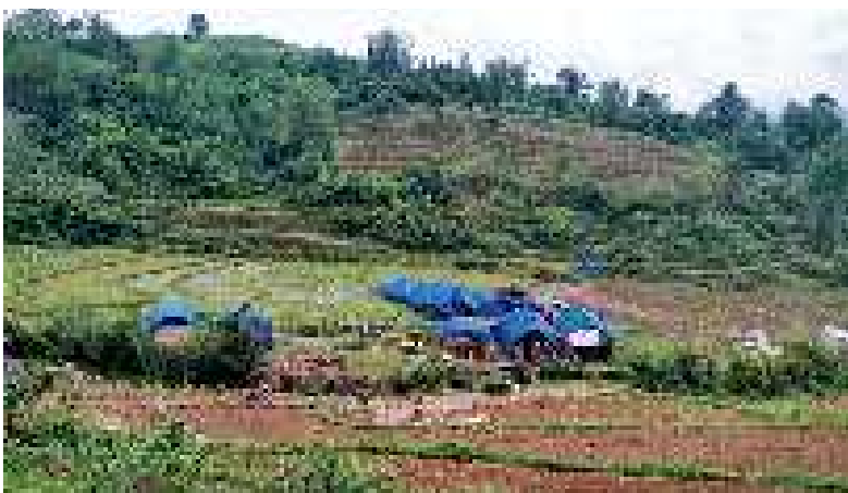
New IDPs camp in Muse