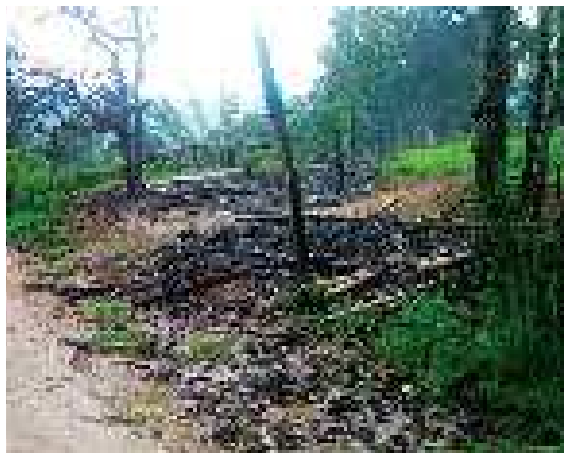
Two houses burned in Man Ping village by Burma Army