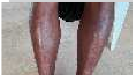
Scars from bamboo rolled on villager’s shins

“On April 21st, 2016, my wife and I and my child had gone to Mong Ko quarter 7 by motorcycle to give some gifts to my wife’s relative. The next day, my brother-in-law took me with him to his farm. On the way back home, at around 5 pm, three Burmese soldiers from Division 99, posted in quarter 7, shouted at the two of us to stop. Since we had not done anything wrong, we stopped walking. Then the three soldiers commanded us to follow them to their base. After we arrived there, a commander and another soldier called the head villager of quarter 7, and asked whether he knew the two of us. The head said he knew my brother in law, but not me.