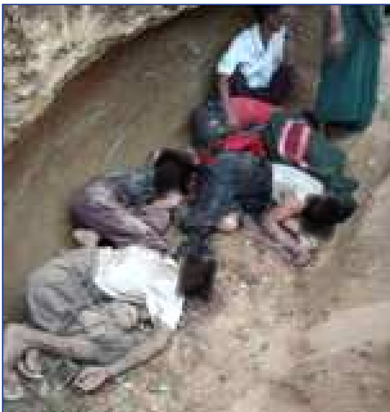
On 21 March 2019, indiscriminate gunfire and shelling by Burma Army forces in Say Taung village, Buthidaung Township, Arakan State killed 4 members of the same family. (AASYC)

According to ND-Burma member organisation All Arakan Students' and Youths' Congress (AASYC), the conflict in Rakhine State since December 2018 has led the displacement of over 31,800 individuals. 21