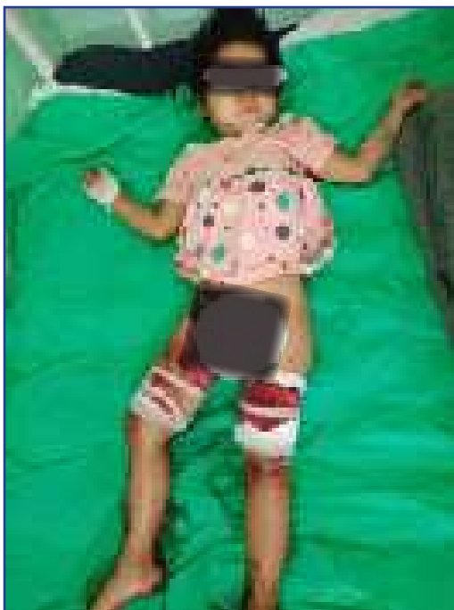
Young child from Man Pan village, Shan State, injured due to landmine explosions. (TWO)

Infantry Battalion (LIB) #416 arbitrarily beat and injured a villager in Namkham Township, Shan State. 3