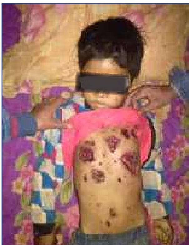
Young child from Man Pan village, Shan State, injured due to landmine explosions. (TWO)

Since the Burma army's declaration of a ceasefire in conflict-affected areas in Kachin and northern Shan states, armed clashes have continued to occur on a regular basis, particularly around villager settlements. Numerous instances of fighting between the Burma army and the KIA, TNLA and the Shan State Progress Party/Shan State Army (SSPP/SSA), among others, in Kachin and northern Shan states were reported (see Appendix 1), and human rights abuses against civilians, including extrajudicial killings; arbitrary arrest, detention and torture; sexual violence; landmine incidents; and indiscriminate aerial and mortar campaigns in civilian areas by Burma army soldiers have been documented by ND-Burma member organisations.