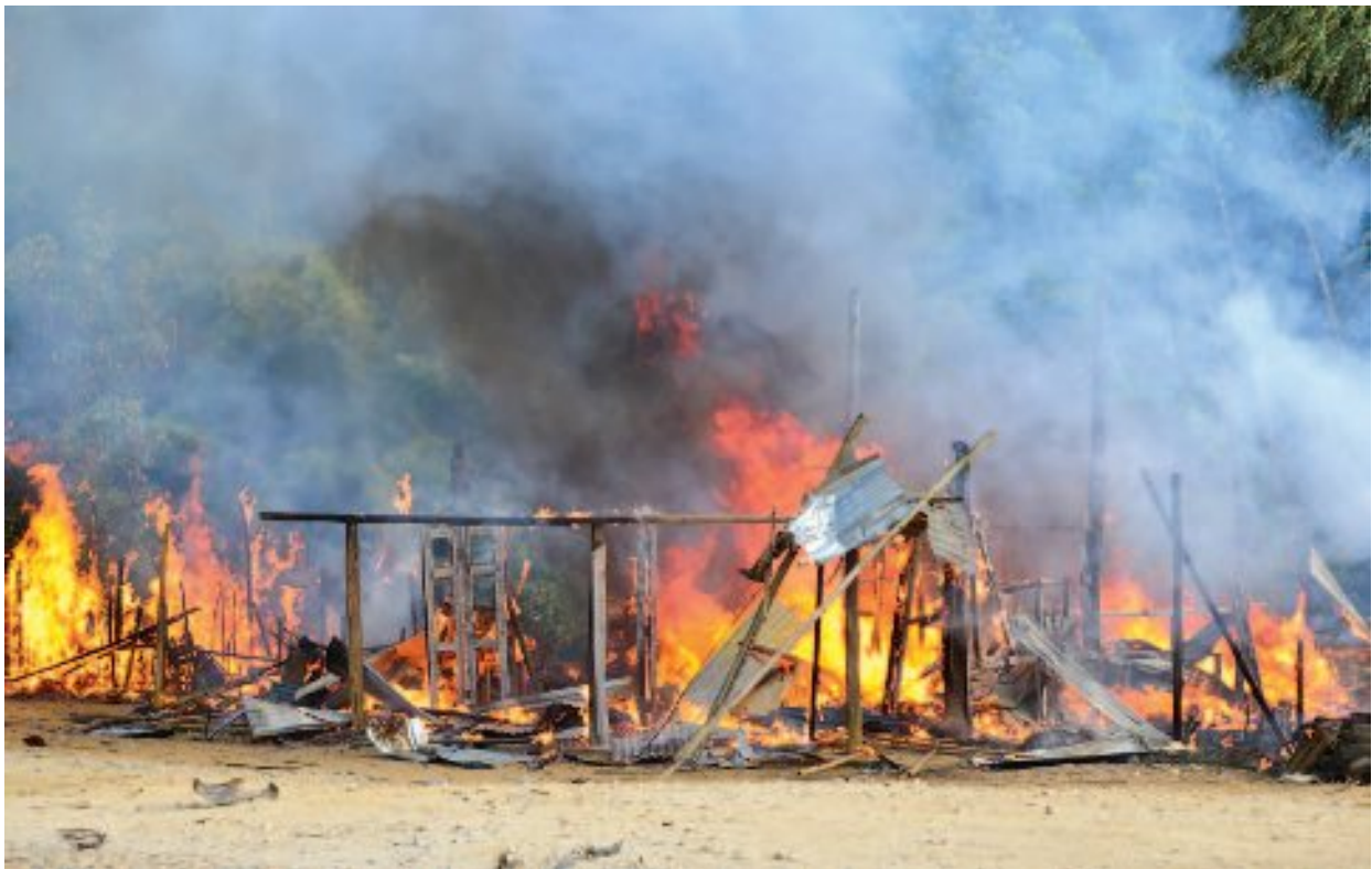
Burma Army air strike: A house in Kachin State burns after being hit by a bomb dropped by Burmese Army forces.