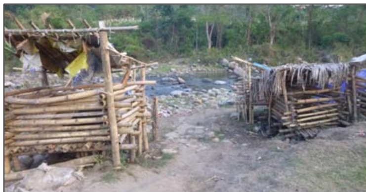
A stone's throw away: Informal border crossing from an IDP camp to China

The inability for most IDPs to access border passes to legally look for work in China is a major risk factor for human trafficking.