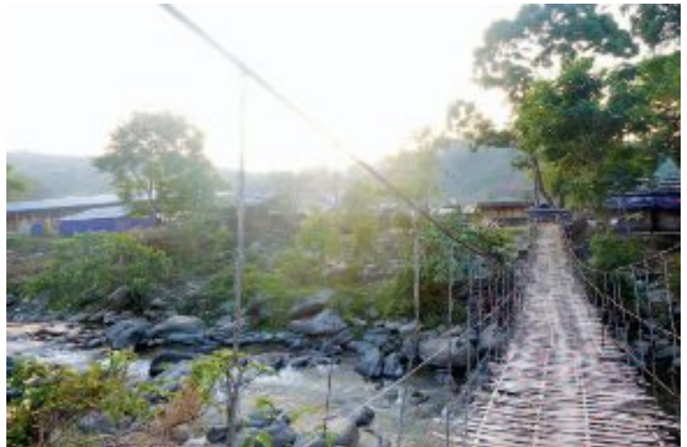
The way across: A wooden bridge links a camp to China

The 17-year-old daughter of an IDP woman was persuaded by her uncle to travel to China while her mother returned back to her village. She ended up being sold as a bride to a Chinese man. Her mother described what happened: