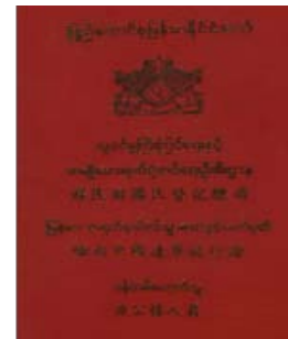
Hard to pass: Border passes for legal travel are nearly impossible for IDPs to access