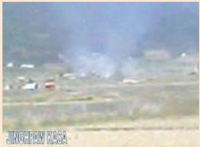
Nowhere to go: Video scene showing Hpaikawng IDP camp burning.

Without legal documents or official protection, the more than 300 villagers who have fled into China to escape invading Burma Army troops are at extremely high risk of being exploited or trafficked.