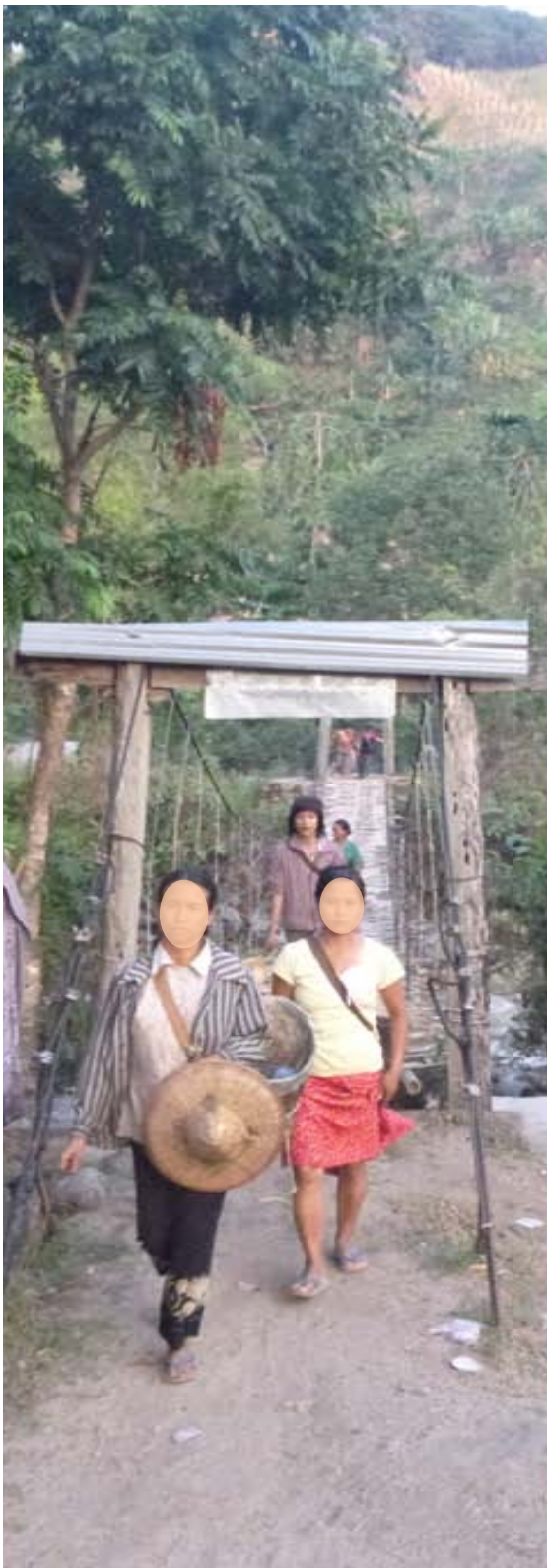
Caught in the middle: Kachin IDPs cross a bridge linking their IDP camp to China.