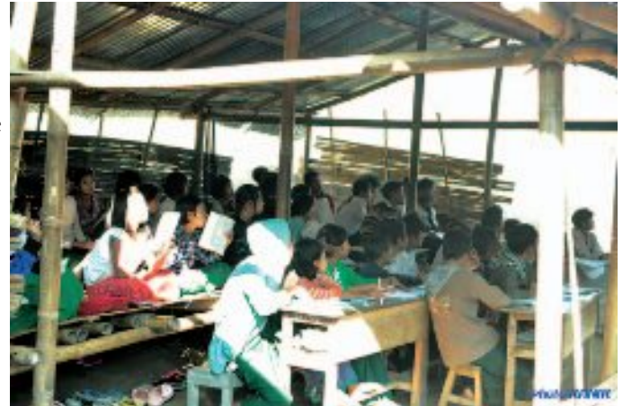
Close quarters: IDP children gather for their studies

This has been a disincentive for children to attend school. According to the mother of the 11-year-old IDP girl who went missing on the China side: