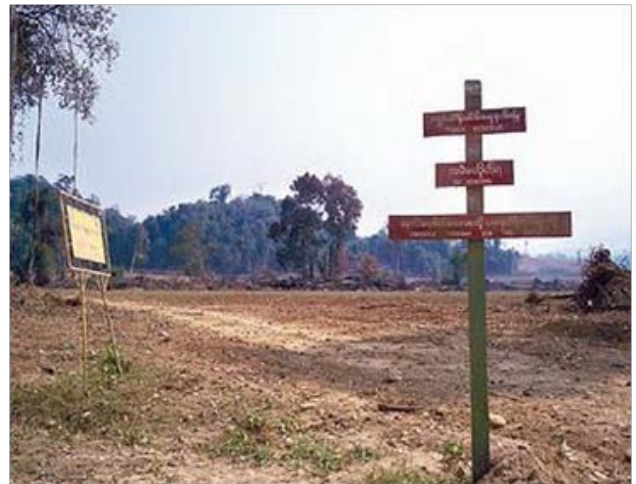
Clear-cut destruction: Lands in the Hukawng Tiger Reserve in Kachin State, including small local farms, were confiscated and razed to make room for commercial sugarcane, tapioca, and jatropha plantations.

Today, the same factors contributing to the problem of trafficking remain, but are exacerbated by the presence of conflict and the massive displacement that has resulted from it.