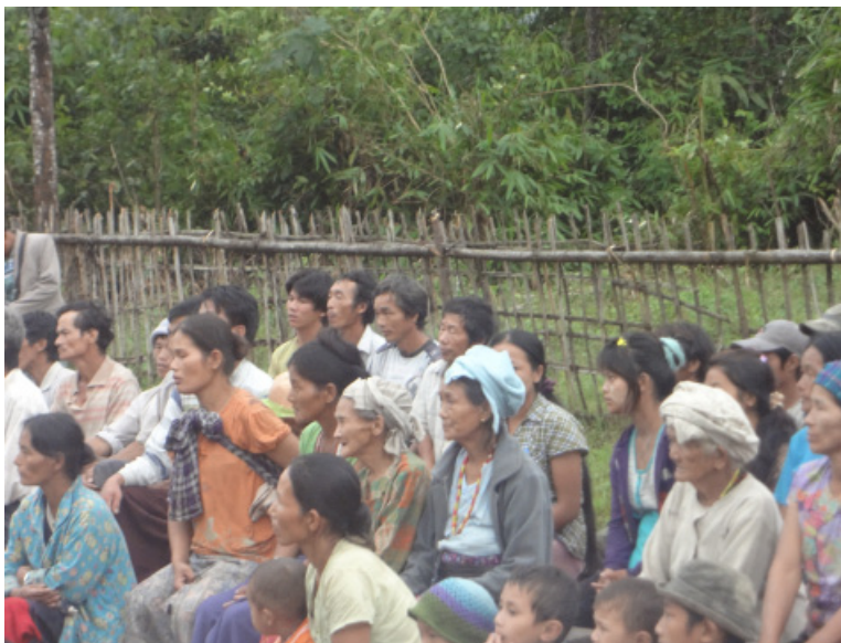
Nhka Ga villagers on 27 September 2013